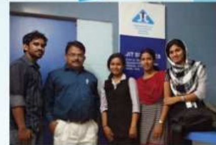
WITH AWARD WINNING TRAINEES