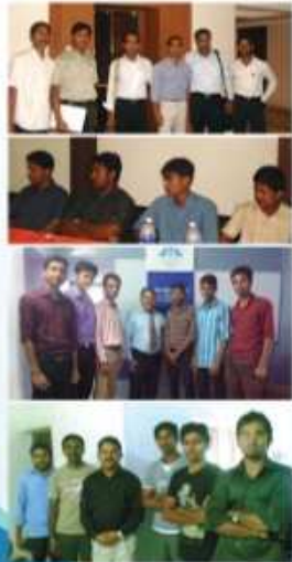
OUR TEAM WITH TRAINEES