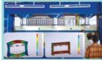
DESIGN TO PRODUCT