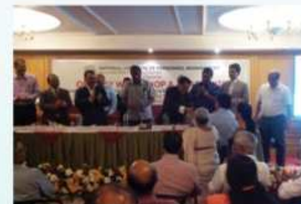
WE RECEIVED NIPM AWARD