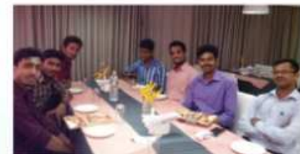
DURING AWARD CEREMONY