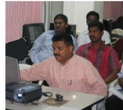
IN HOUSE TRAINING